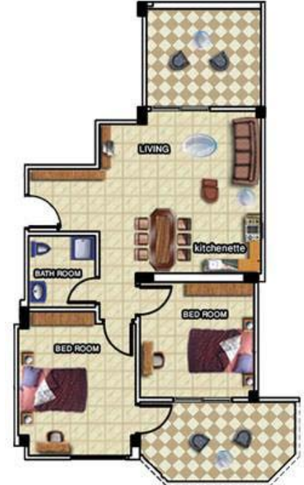
Two Bed 78 m 2