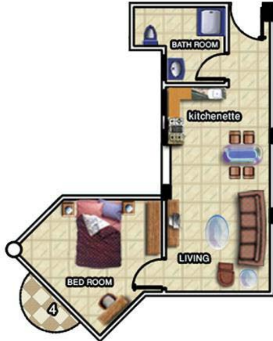
One Bed From 48 m 2