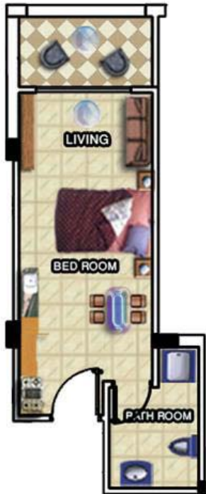
Studio 30 m 2